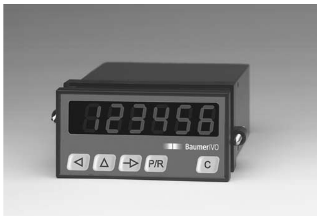
PCD41 - Process display