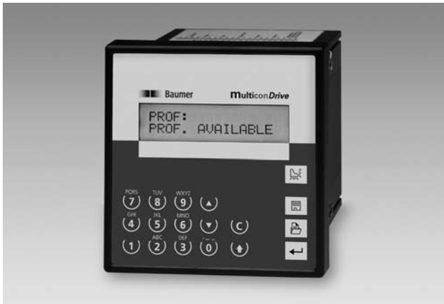
N 242 - Automated/manual format alignment