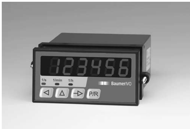
TA200 - LED-Tachometer