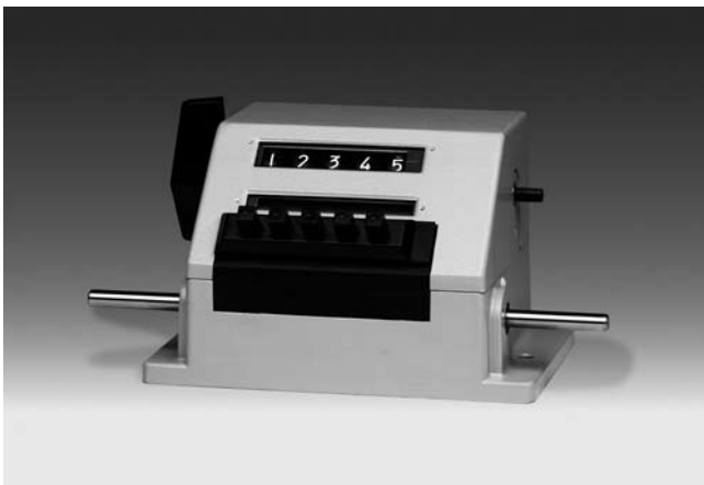
UE280 - Revolution counter