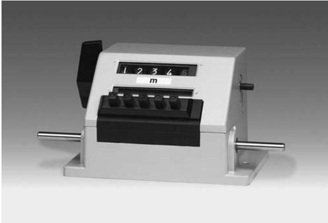
ME280 - Meter counter