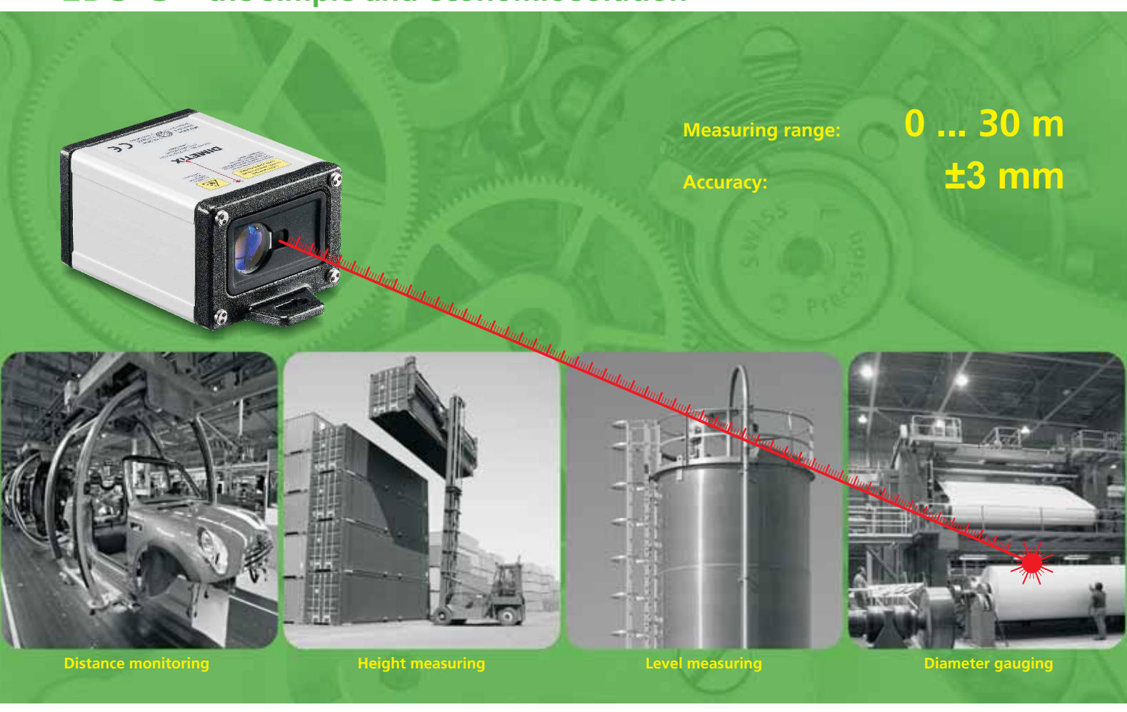
EDS-C – the simple and economic solution