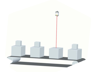
Assembly control / Object recognition