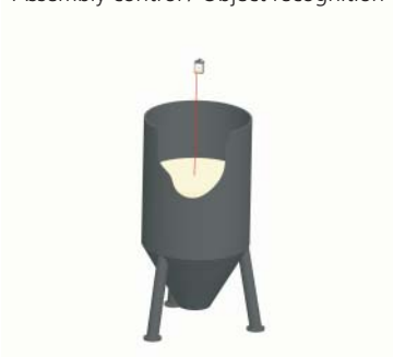
Level measuring of silos